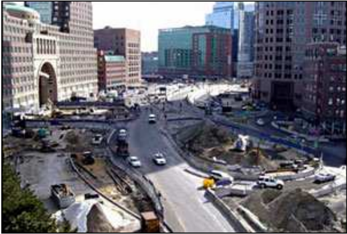
Figure 2b. Vision of the Greenway during the Day