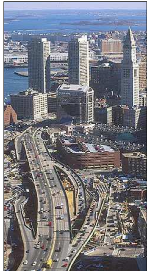
Figure 1. The elevated Central Artery Courtesy of the Massachusetts Turnpike Authority (www.masspike.com).

The original Environmental Certification for the Big Dig specified that 75% of the 27 acres of land freed up by the removal of the Central Artery was to remain open and undeveloped. 3 Control over the Greenway acres became the source of tremendous turmoil among city, state, and community groups. In 2004, after years of debate over who should control the land, the MTA, the Commonwealth of Massachusetts, the City of Boston and the Kennedy family established an independent nonprofit entity to manage the project.