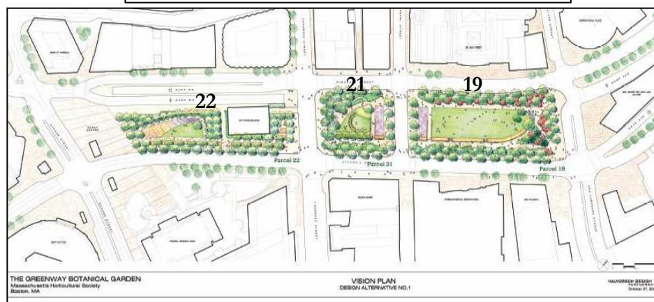
Figure 5. An example vision for parcels 19, 21, 22 Courtesy of Halvorson Design

Though their plans have not yet been finalized, MassHort expects to create open park space on all three parcels initially and to construct a multi-function building on Parcel 22 in a later phase of development. MassHort has been working with Halvorson Design 7 , a renowned Boston-based landscape design firm, to sketch different possibilities for its parcels (see Figure 5). The demonstration food garden is most likely to be placed on Parcel 21, which is just over a third of an acre in size. While MassHort has not determined how much of the parcel to dedicate to a demonstration food garden, it will realistically be no larger than a quarter of an acre. Aside from other factors, the size of the garden is limited by the amount of sunlight that reaches the parcel. Only three-quarters of the parcel (~ 0.25 acres) receives six or more hours of sunlight daily from late April to late August, which is the minimum length of daylight needed to support most of the plants that would likely be grown (see appendix A for the sunlight study).