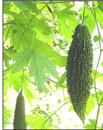
Bitter Melon