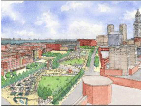
Figure 3. The Greenway Conservancy’s Vision

The Rose Fitzgerald Kennedy Greenway Conservancy was established to oversee the fundraising, operation, planning, and maintenance of the Greenway. 4 As community groups and government officials grew eager to see development begin, the Conservancy enlisted numerous local designers to provide conceptualizations of a central promenade complete with parks, gardens, and fountains, as well as cultural facilities, an outdoor cafe, and areas for large-scale events (See Figure 3). The Conservancy was tasked with raising $20 million by the end of 2007, with the MTA promising to provide up to $5 million to match all private-sector