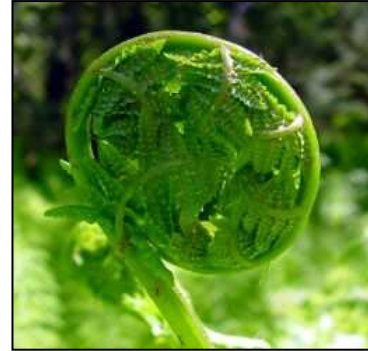
Fiddlehead Fern