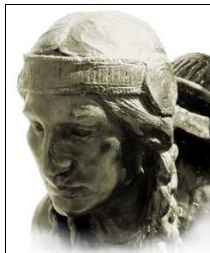
Squaw Sachem, leader of the Massachusetts

As one of the oldest cities in the U.S., Boston is a major tourist destination. From the region's many native peoples to the English settlers who arrived in 1620, seeking religious freedom from England, we are at the epicenter of American history. The proximity of the Greenway to Boston's famous Freedom Trail, offers an opportunity to explore Boston's history through a food garden planted with fruits and vegetables eaten by our city's first inhabitants. In this garden, visitors would see both familiar plants like beans, squash, and onions and less familiar ones utilized by the native people, like fiddlehead ferns, salsify, and hazelnuts. Plantings would be primarily native to the region or important historically.