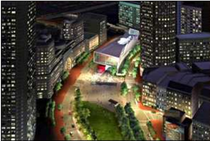
Figure 2c. Vision of the Greenway at Night