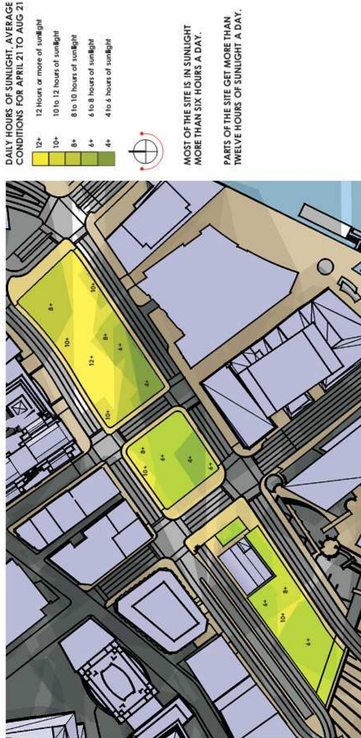
GREENWAY BOTANICAL GARDEN - COMPOSITE SUNLIGHT STUDY FOR SITE Massachusetts Horticultural Society - Boston, MA