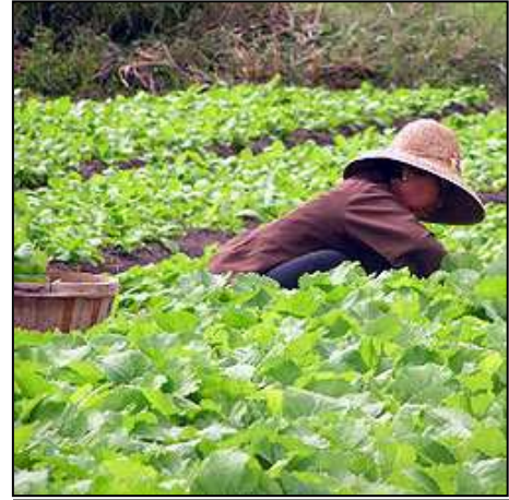
Khmer farmer harvesting mustard greens in Dracut, MA

Boston, like all of the U.S., has been shaped by immigrants from all over the world. In Massachusetts, one in seven residents was born in another country. 21 The state has experienced multiple waves of immigration, from the early colonists to later waves of Irish and Italian immigrants. Today, nearly half of Boston's recent immigrants have come from Latin America, a quarter from Asia, seventeen percent from Europe, and nine percent from Africa. 22 These diverse populations bring an equally diverse set of culinary experiences, and many of the people come with farming experience. The 2002 U.S. Census of Agriculture shows immigrant farmers to be the fastest growing group of farmers in the nation. 23