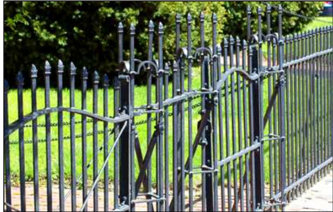
An example of appropriate fencing

by a forbidding fence. Rather, the fencing should be about three feet, or lower, in height and should have an open face to maximize the visibility of the garden and park area. Making the garden visible from the outside will entice passersby to come in and explore it and will create a greater sense of safety within the garden area. If the demonstration food garden does experience an unacceptable level of theft or vandalism for more than a few years, then we would recommend installing a taller, more substantial fence that it is difficult to climb over. It should remain open faced, but should not have gaps wide enough for a person to crawl through.